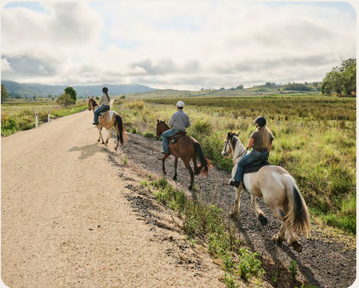
Image: Northern Rivers Rail Trail, Richmond Valley Council.