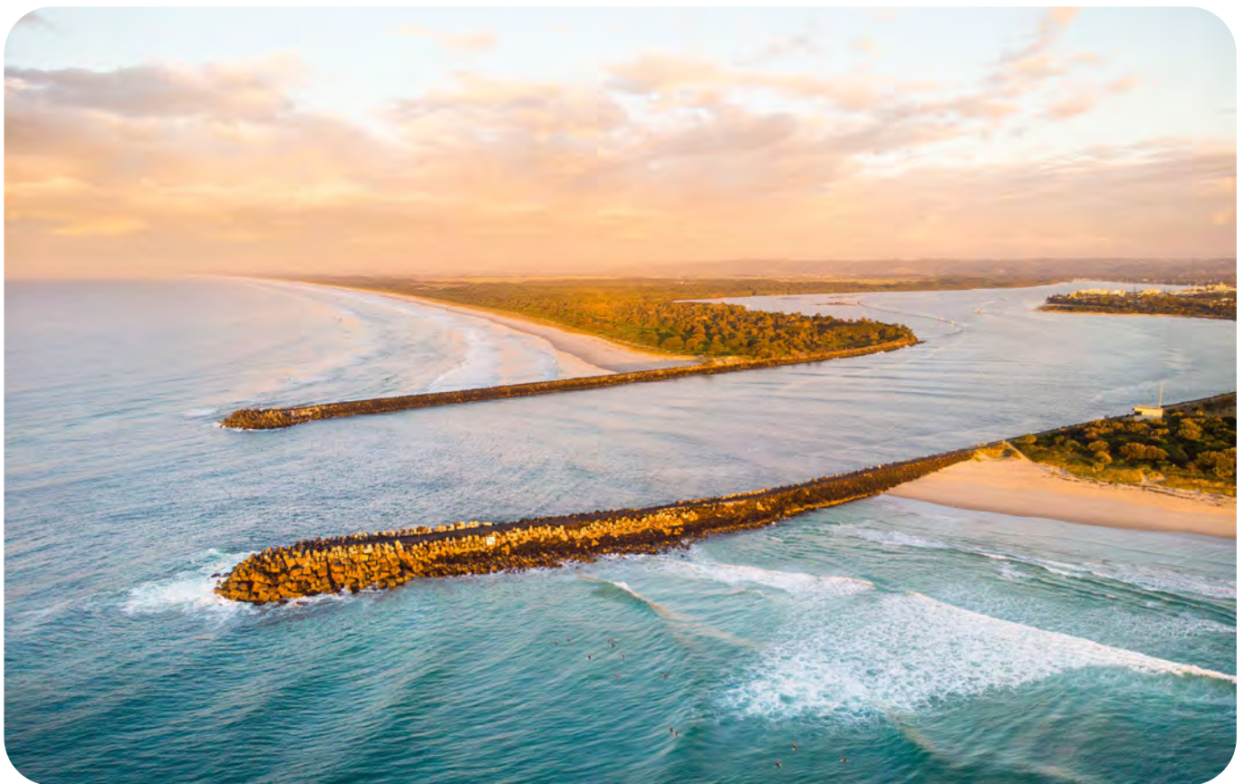
Image: Ballina Break Wall, Ballina.